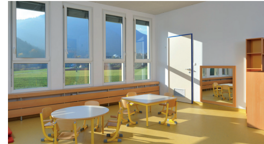
Kindergarten Biba, Škofja Loka, Slovenia