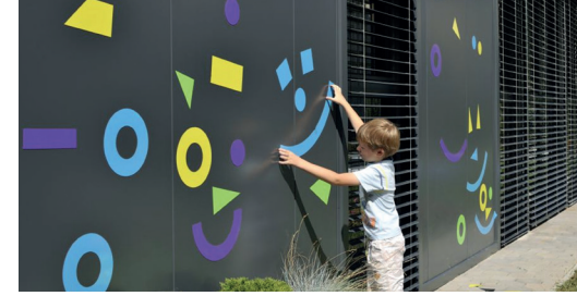
Kindergarten Ajda, Ravne na Koroškem, Slovenia

Kindergarten Biba, Škofja Loka, Slovenia