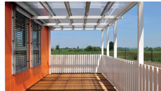
Kindergarten, Podpeč, Slovenia