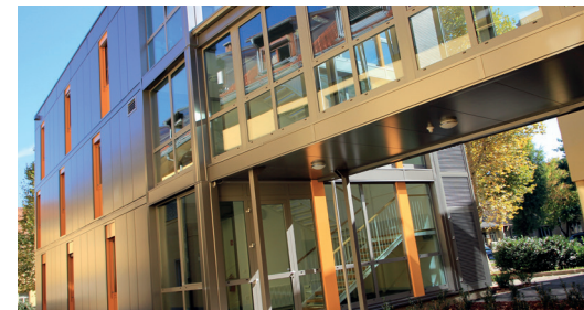
Faculty of Medicine, Ljubljana, Slovenia